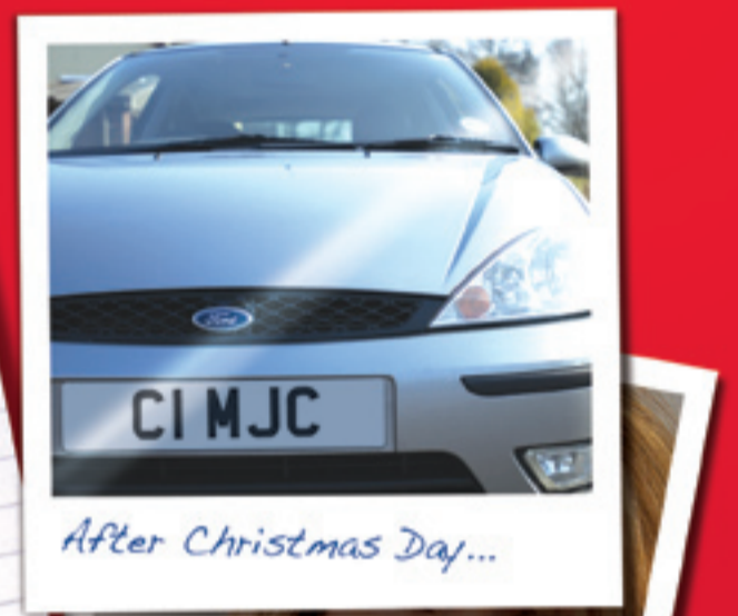
After Christmas Day...