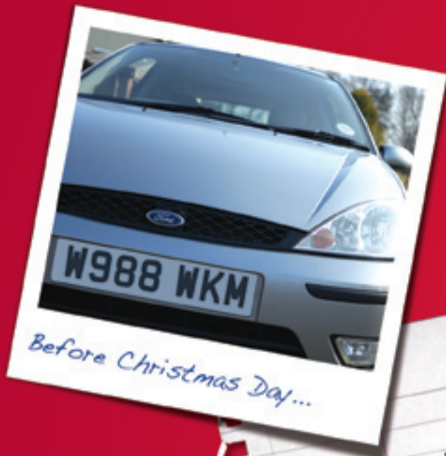
Before Christmas Day...